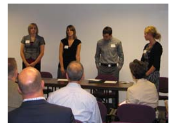
EAM Club board members discussing their year's activities with the Advisory Council.