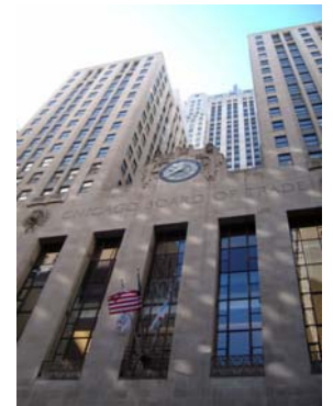
Venture Funds helped EAM Club members travel to Chicago, Illinois.