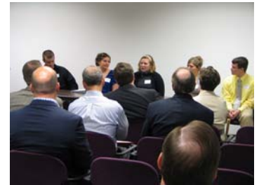
EAM students discuss their internships during the Advisory Council meeting.

Associate Professor of Business Management